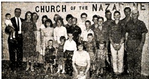
Colorado City congregation, 1963

Prayer and fasting meetings for adults and for