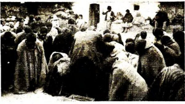
They kneel in the dust to pray

There is a Church of the Nazarene in Alcoche now, thanks to the sacrificial giving of Nazarenes at home.