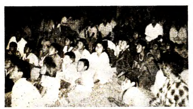
Hearing the gospel for the first time