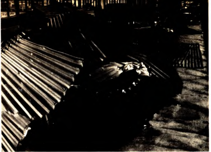
NEW GUINEA STORM RESULTS —Damage from a "freak" rain and wind-storm is reflected in the photo on the left in the partially constructed hospital wing on the New Guinea mission station. Two male nurses were injured along with $3,000 damage.