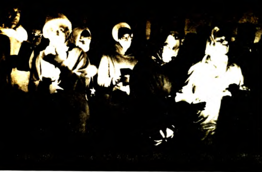
BENEATH THE BELL TOWER of the Church of the Nativity, Bethlehem, Jordan, tourists mingle, singing Christmas carols at 9:00 on Christmas Eve. At midnight, the bell tower peels out the message, "Jesus is born."