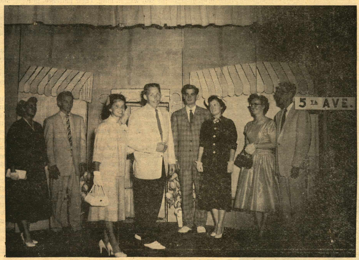
Pictured here is the fifth avenue scene from the Crusader Choir pageant, "Songs of the Seasons."